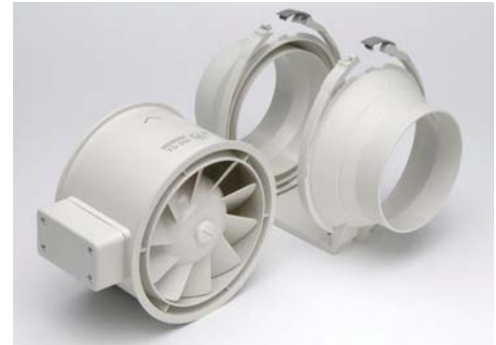
Internal parts can be easily removed for mounting & servicing