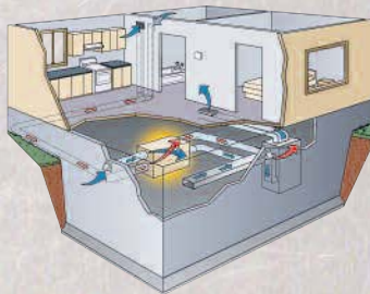
Return Connection — Extended Exhaust