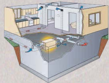
Fully Ducted System